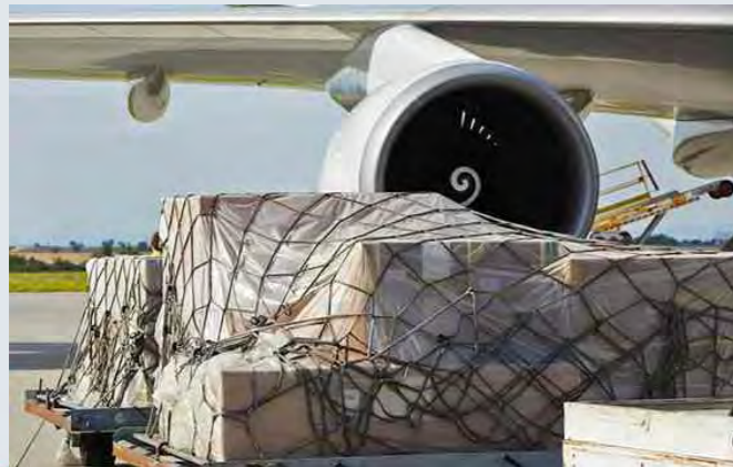
▲ Air Freight