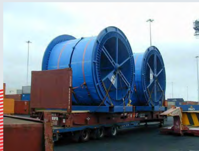
Heavy Duty Logistics