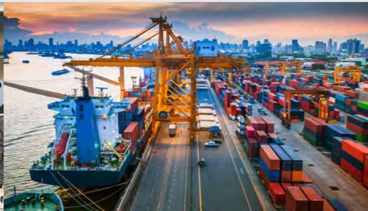
▲ Sea Freight