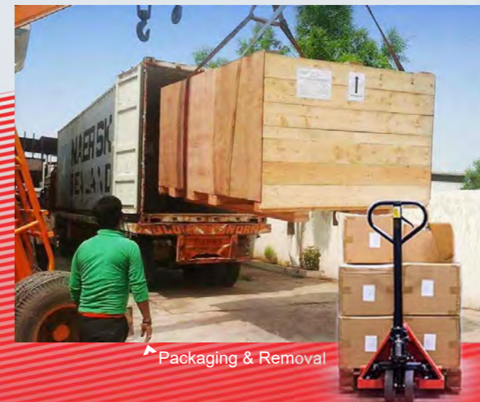
Packaging & Removal

We independently perform Cargo Survey/inspection on behalf of clients for Import/Export (on Board of marine vessels; from origin, at warehouse, importer's premises, de-stuffing point). Thus ascertain compliance with order specifications also local and international regulations. all backed with full documented reporting system.