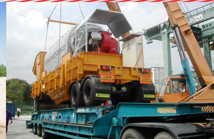
Oil & Gas Logistics